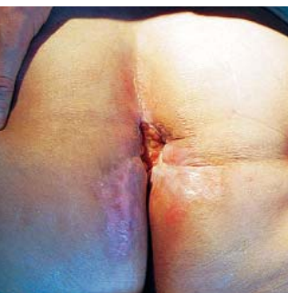
Result after 4 weeks