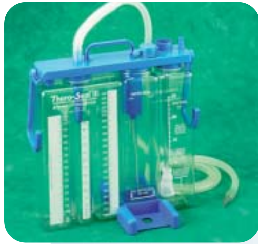
THORA-SEAL III Chest Drainage Unit