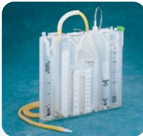
ARGYLE DOUBLE SEAL Chest Drainage Unit