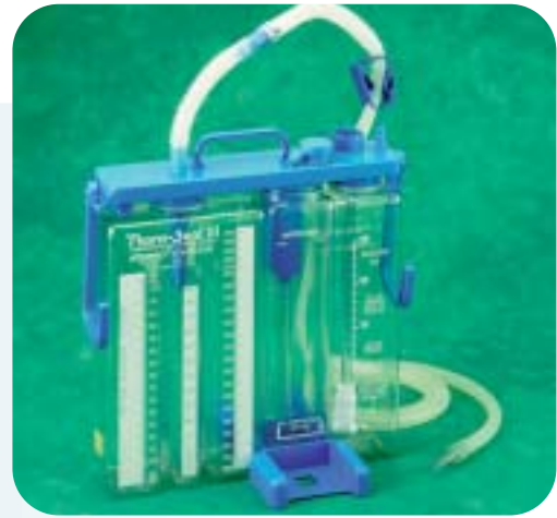
THORA-SEAL III Autotransfusion Chest Drainage Unit