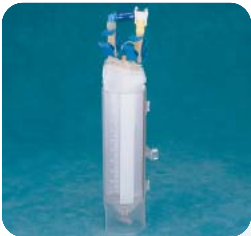
ARGYLE SENTINEL SEAL Autotransfusion Accessory Unit